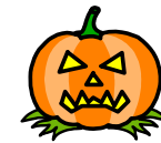
Jack O Lantern