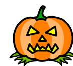
Jack O Lantern